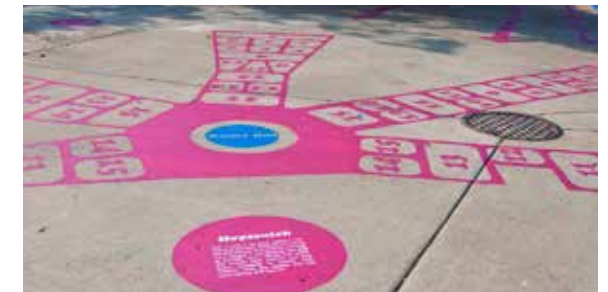
Gabe Klein Former Commissioner Chicago Department of Transportation Tactical Urbanism, Placemaking, Policy

"Everyday we had 6 staff and 15 students sharing space reluctantly in our studio. The impact from simple changes is huge. Everyone wants to be here."